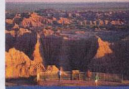
Spectacular Badlands National Park