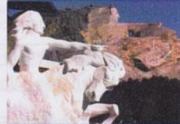
Crazy Horse Monument to be 10x the size of Mt. Rushmore