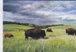
Wildlife enhances the pristine Black Hills